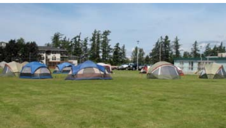
The tents are on the field.

As I write this, we are in the midst of Vacation Church School. Over 100 children are running (even though they've been told not to) around the campus of First Christian Church. Some of the children are from St. James. As are some of the adults, who are helping out in the kitchen. (Where would we be without them and their faithful service, year after year?) There is laughter, music, dancing, art, drama, and activity around every corner. Bible stories are brought to life. The tents are on the field. The sanctuary has been transformed. And each day we are being reminded, by our leaders and our sur-